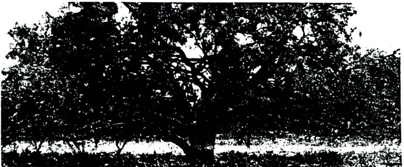
The mesquite tree has a multi-stemmed trunk.

A wood's surface hardness is a measure of its ability to withstand being "dented" when subjected to heavy loads. It may be or may not be an indicator of scratch resistance, depending on various factors. Surface hardness is measured by determining the pounds of force necessary to embed a 0.44 inch diameter ball one-half of its diameter into the wood surface. This figure, although having not absolute value, can be used for comparative purposes between samples of a species, between species, and for different coatings for wood surfaces.